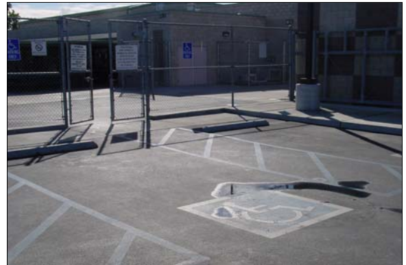
Accessible Parking next to the MPR

Alternative Rec: * Rec: (Where Available)