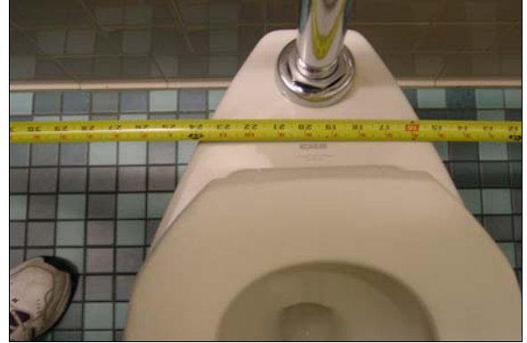
Girls Restroom Across from Room 114

Full Rec Relocate the toilet so the distance from the centerline of the toilet to the nearest side wall is exactly 18 inches (see ADAAG Figure 28).