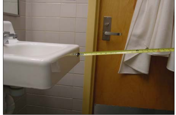
Staff Womens Restroom in the Main Office

Full Rec Provide at least 12 inches of latch side clearance at the entrance door to the restroom from the push side (see ADAAG 4.13.6 and Figure 25). Otherwise, install an automatic door opening device to the primary entrance complying with ADAAG 4.13.12 and ANSI/BHMA A156.10, 1985, standards.