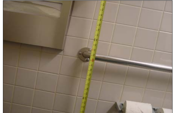
Staff Womens Restroom in the Main Office

Full Rec Remount the side and back grab bar in the restroom so that the height of the gripping surface is centered at 33 inches above the finished floor. The side grab bar must extend at least 54 inches from the back wall.