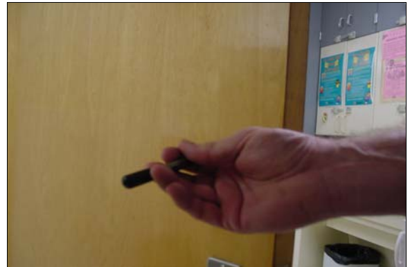
Unisex Restroom in the Nurses Office

Full Rec Adjust the closer on the interior entrance door to the restroom to a maximum door opening force of 5 pounds (see CBC 1133B.2.5.1 and ADAAG 4.13.11).