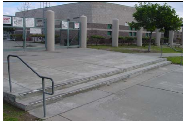
Exterior Stairs next to the Bus Loading Zone

Alternative Rec: * Rec: (Where Available)