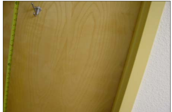
Staff Mens Restroom in the Main Office

Full Rec Relocate the coat hook to a height no greater than 48 inches above the floor.