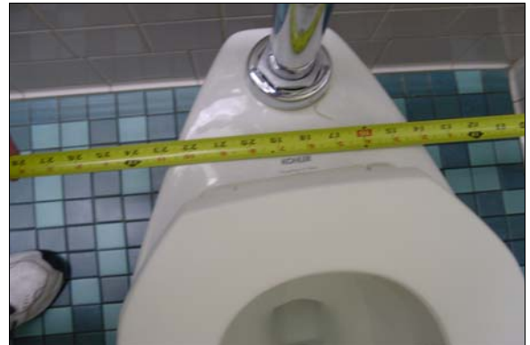
Staff Mens Restroom in the Main Office

Alternative Rec: * Rec: (Where Available)