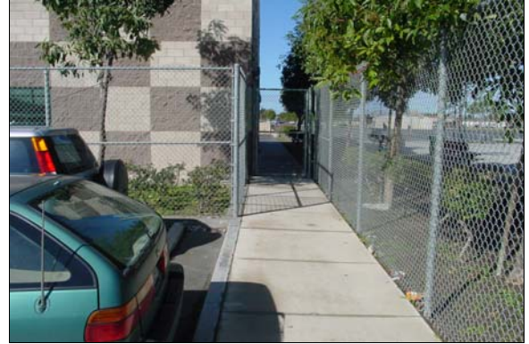
Gate from Florence Avenue Parking to School

Full Rec Install a panel or replace the gate to provide a smooth, uninterrupted surface for the bottom 10 inches of the door.