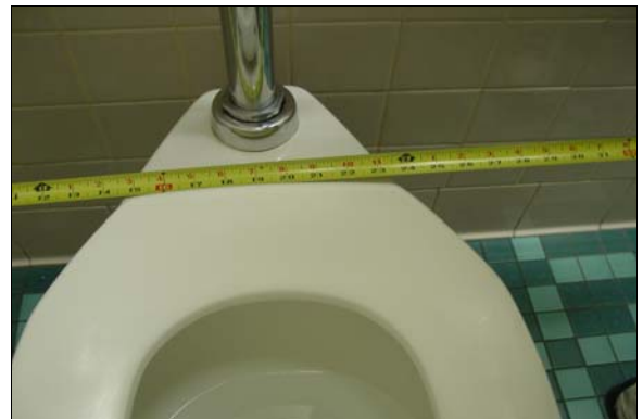
Staff Womens Restroom in the Main Office

Full Rec Relocate the toilet so that the distance from the centerline of the toilet to the nearest side wall is exactly 18 inches (see ADAAG Figure 28).