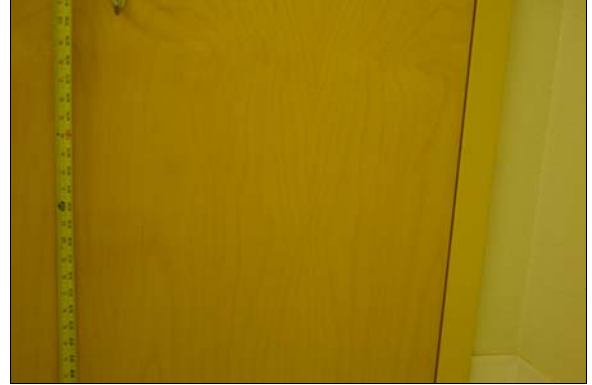
Staff Unisex Restroom in the Staff Lounge

Full Rec Relocate the coat hook to a height no greater than 48 inches above the floor.