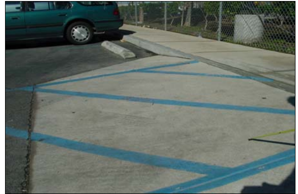
Curb Ramp at the Access Aisle

Alternative Rec: * Rec: (Where Available)