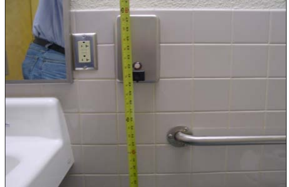
Staff Mens Restroom in the Main Office

Full Rec Relocate the soap dispenser to a maximum height of 40 inches for all the controls and operating mechanisms (see CBC 1115B.9.2).