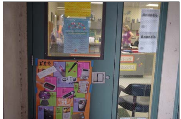
Main Entrance to the Office

Alternative Rec: * Rec: (Where Available)