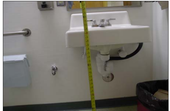
Unisex Restroom in the Nurses Office

Alternative Rec: * Rec: (Where Available)