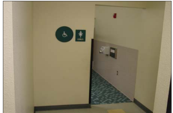
Girls Restroom Across from Room 114

Alternative Rec: * Rec: (Where Available)