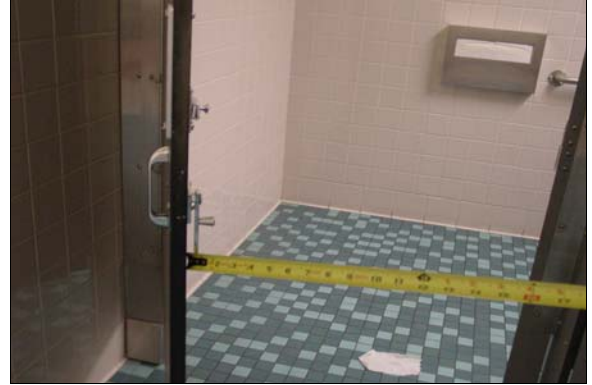
Boys Restroom Across from Room 114

Alternative Rec: * Rec: (Where Available)