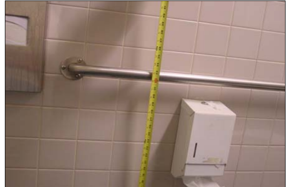
Boys Restroom Across from Room 114

Full Rec Remount the side and back grab bar so the height of the gripping surface is centered at 33 inches above the finished floor. Grab bars must be able to support a point load of at least 250 pounds and shall be less than the allowable shear stress of the grab bar material.