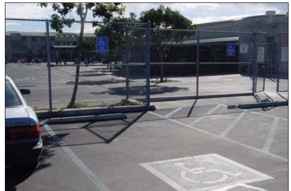
Parking next to the MPR

Full Rec Affix detectable warning stripes to the entrance and exit of each access aisle.