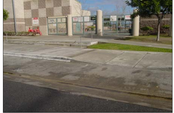
Bus Loading Zone in front of the School

Alternative Rec: * Rec: (Where Available)