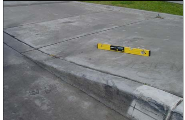
Curb Ramp at the Bus Loading Zone

Full Rec Replace the concrete curb-cut ramp with a concrete curb-cut ramp at least 48 inches in width that provides a slope no greater than 8.33% and a cross slope no greater than 2%. The slope of the top landing shall not exceed 2% and shall provide at least 48 inches in length of maneuvering clearance. The bottom landing shall provide a smooth transition. The side flares shall be no greater in slope than 10%. Provide a compliant 36 inch strip of truncated domes on the curb ramp.