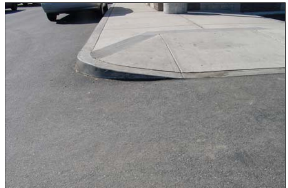
Curb Ramp at the Florence Avenue Parking Lot

Full Rec Replace the concrete curb-cut ramp with a concrete curb-cut ramp at least 48 inches in width that provides a slope no greater than 8.33% and a cross slope no greater than 2%. The slope of the top landing shall not exceed 2% and shall provide at least 48 inches in length of maneuvering clearance. The bottom landing shall provide a smooth transition. The side flares shall be no greater in slope than 10%. Provide a compliant 36 inch strip of truncated domes.