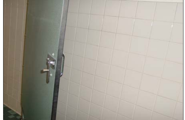
Girls Restroom Across from Room 114

Alternative Rec: * Rec: (Where Available)