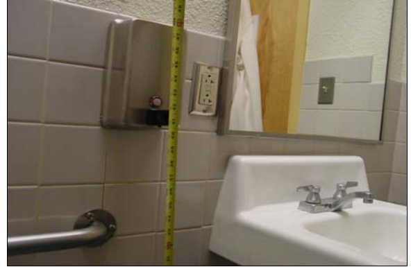
Staff Womens Restroom in the Main Office

Full Rec Relocate the soap dispenser to a maximum height of 40 inches for all the controls and operating mechanisms (see CBC 1115B.9.2).