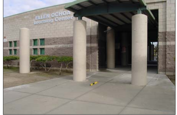
Sidewalk to the Main Entrance

Alternative Rec: * Rec: (Where Available)