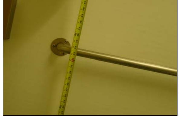
Staff Unisex Restroom in the Staff Lounge

Full Rec Remount the side and back grab bar in the restroom so that the height of the gripping surface is centered at 33 inches above the finished floor. The side grab bar must extend 54 inches from the back wall.