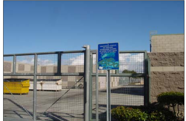
Accessible Parking next to the MPR

Full Rec Fill in the blank spaces which are required to furnish the point of contact and telephone number for reclaiming towed vehicles with the appropriate information as a permanent part of the sign and maintain the currency of the information (see CBC 1129B.5). Make sure to add the CVC22511.8(a)(d) to the sign.