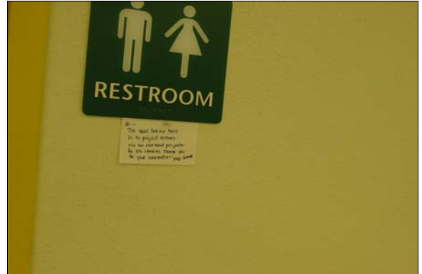
Staff Unisex Restroom in the Staff Lounge

Alternative Rec: * Rec: (Where Available)