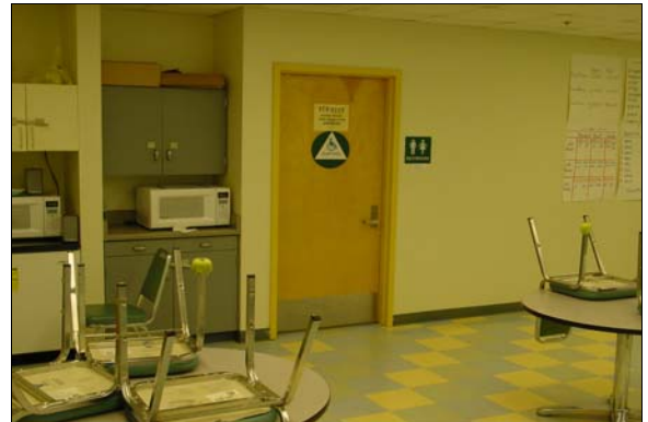
Staff Unisex Restroom in the Staff Lounge

Alternative Rec: * Rec: (Where Available)