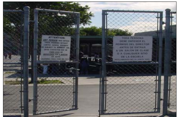
Gate from MPR Parking Lot to School

Full Rec Replace the existing gate hardware with accessible hardware (see ADAAG 4.13.9).