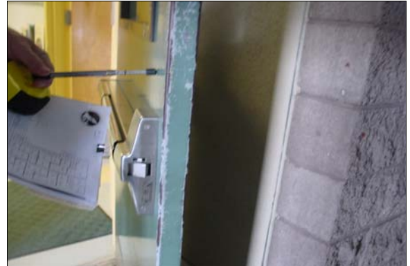
Main Entrance to the Office

Alternative Rec: * Rec: (Where Available)