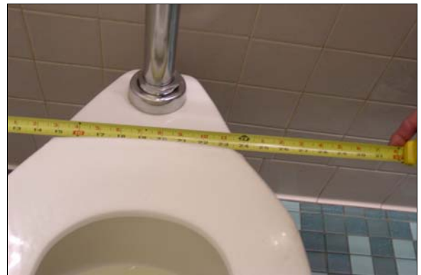
Boys Restroom Across from Room 114

Full Rec Relocate the toilet so that the distance from the centerline of the toilet to the nearest side wall is exactly 18 inches (see ADAAG Figure 28).