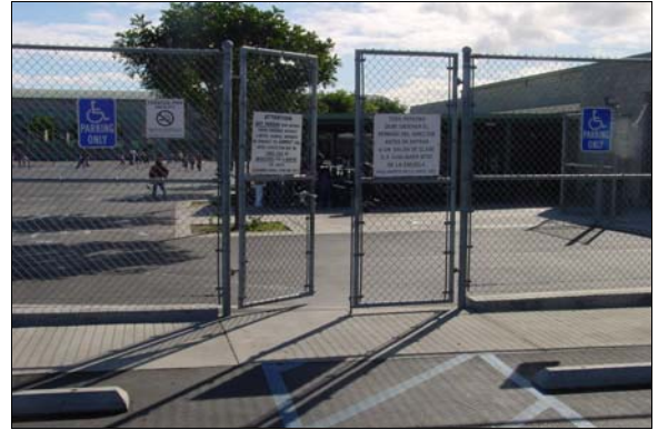
Gate from MPR Parking Lot to School

Full Rec Install a panel or replace the gate to provide a smooth, uninterrupted surface for the bottom 10 inches of the door.