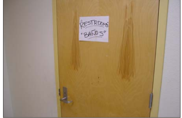
Unisex Restroom in the Nurses Office

Full Rec Post signage centered 60 inches above the ground surface on the latch side of the entrance door identifying the restroom as accessible. Signage shall include Braille and raised lettering, the gender or unisex use symbol and the ISA symbol. Post Title 24 gender use signage on the door @ 60" o.c. a.f.f.