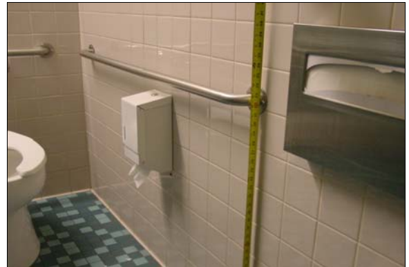
Girls Restroom Across from Room 114

Alternative Rec: * Rec: (Where Available)