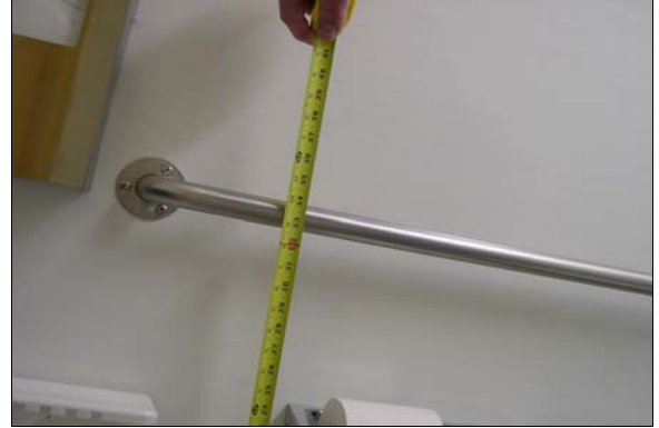
Unisex Restroom in the Nurses Office

Alternative Rec: * Rec: (Where Available)