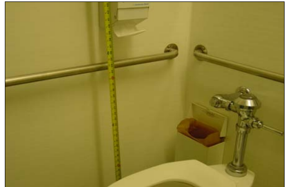
Staff Unisex Restroom in the Staff Lounge

Full Rec Remount the toilet paper dispenser so it is within 12 inches from the front edge of the toilet (see CBC 1115B.9.3 and ADAAG Figure 29(b)). Toilet paper dispensers must allow continuous paper flow and shall not interfere with the use of the side grab bar.