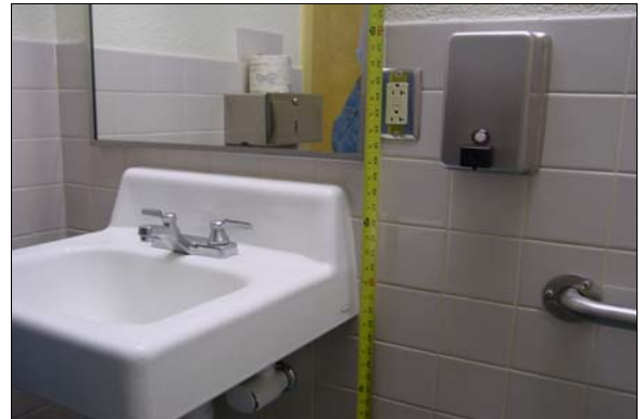
Staff Mens Restroom in the Main Office

Full Rec Lower the mirror so the bottom edge of the reflecting surface is no higher than 40 inches above the finished floor and the topmost portion of the reflecting surface extends at least 74 inches above the finished floor (see ADAAG A4.19.6). A single, full-length mirror is recommended since it can accommodate all people. Make certain to provide a minimum clear floor space in front of the mirror of 30 inches in width and 48 inches in length.