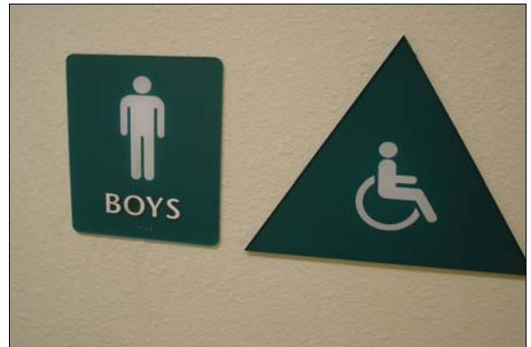
Boys Restroom Across from Room 114

Full Rec Post signage centered 60 inches above the ground surface on the latch side of the entrance door identifying the restroom as accessible. Signage shall include Braille and raised lettering, the gender or unisex use symbol and the ISA symbol.