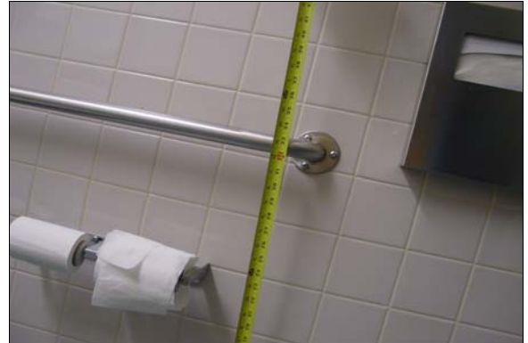
Staff Mens Restroom in the Main Office

Alternative Rec: * Rec: (Where Available)