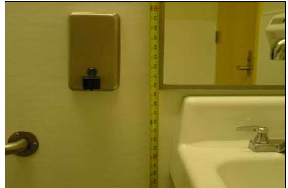
Staff Unisex Restroom in the Staff Lounge

Full Rec Relocate the soap dispenser to a maximum height of 40 inches for all the controls and operating mechanisms (see CBC 1115B.9.2).