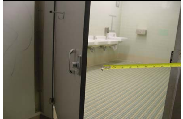
Boys Restroom next to the Small Gym

Alternative Rec: * Rec: (Where Available)