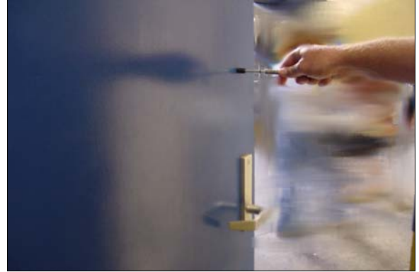
Girls Restroom next to the Small Gym

Full Rec Adjust the closer on the interior entrance door to the restroom to a maximum door opening force of 5 pounds (see CBC 1133B.2.5.1 and ADAAG 4.13.11).