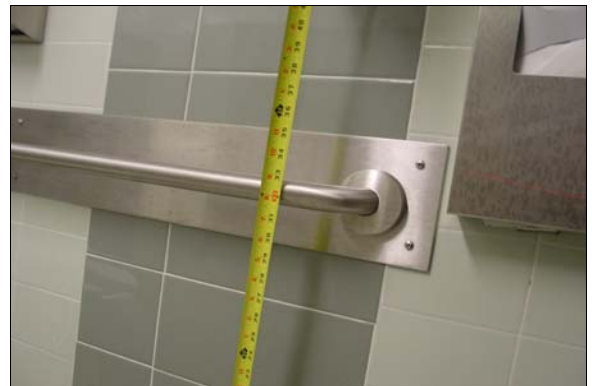
Boys Restroom next to the Small Gym

Alternative Rec: * Rec: (Where Available)