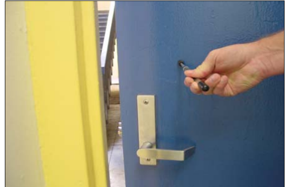
Boys Restroom next to the Small Gym

Full Rec Adjust the closer on the interior entrance door to the restroom to a maximum door opening force of 5 pounds (see CBC 1133B.2.5.1 and ADAAG 4.13.11).