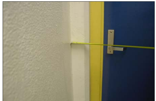
Boys Restroom next to the Small Gym

Full Rec Provide at least 12 inches of latch side clearance or install an automatic door opening device complying with ADAAG 4.13.12 and ANSI/BHMA A156.10, 1985, standards.