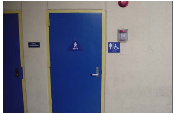
Boys Restroom next to the Small Gym

Finding: There is gender use signage on the door and signage indicating accessibility on the latch side of the entry door of the restroom. The signage is not centered 60 inches above the floor.