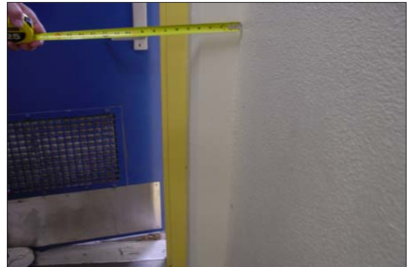
Girls Restroom next to the Small Gym

Full Rec Provide at least 12 inches of latch side clearance or install an automatic door opening device complying with ADAAG 4.13.12 and ANSI/BHMA A156.10, 1985, standards.