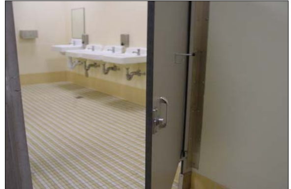
Girls Restroom next to the Small Gym

Full Rec Provide an automatic door closer, spring hinge, pull bar or accessible handle mounted on the inside of the door. Accessible hardware on the inside and outside of the accessible toilet compartment shall be equipped with a loop or U-shaped handle mounted immediately below the latch. The latch shall be flip-over style, sliding or other hardware not requiring grasping or twisting.