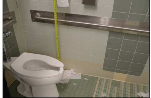
Boys Restroom next to the Small Gym

Full Rec Remount the toilet paper dispenser so it does not interfere with the use of the side grab bar and is within 12 inches of the front edge of the toilet.