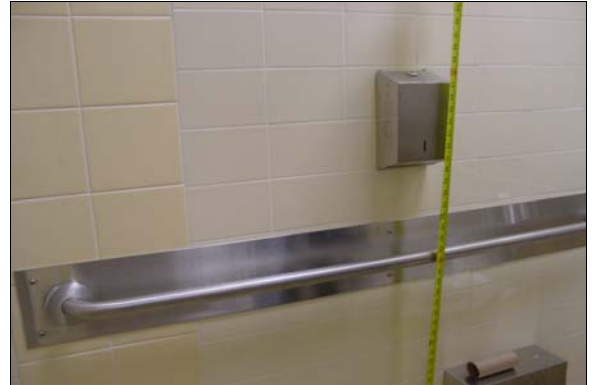
Girls Restroom next to the Small Gym

Full Rec Remount the toilet paper dispenser so it does not interfere with the use of the side grab bar and is within 12 inches of the front edge of the toilet.