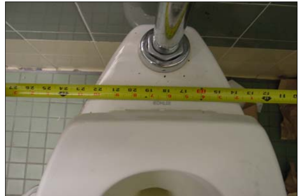
Boys Restroom next to the Small Gym

Full Rec Relocate the toilet so that the distance from the centerline of the toilet to the nearest side wall is exactly 18 inches (see ADAAG Figure 28).