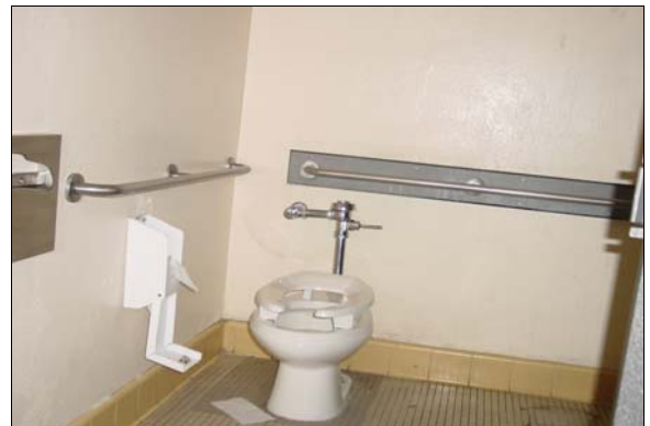
Boys Restroom next to the Cafeteria

Full Rec Remount the side and back grab bar so the height of the gripping surface is centered at 33 inches above finished floor. The side grab bar must extend 54 inches from the back wall.