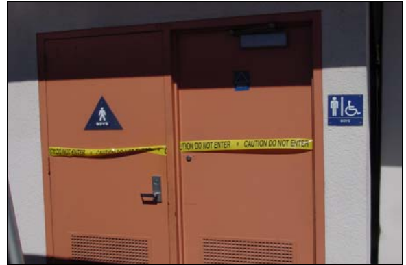
Boys Restroom next to the Cafeteria

Full Rec Adjust the closer on the interior entrance door to the restroom to a maximum door opening force of 5 pounds (see CBC 1133B.2.5.1 and ADAAG 4.13.11).