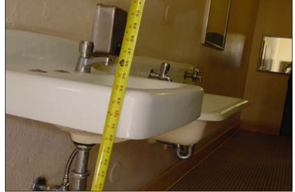
Girls Restroom next to the Cafeteria

Full Rec Insulate or otherwise configure pipes under the lavatory designated to be accessible in the restroom to protect against contact (see ADAAG 4.19.4). Make certain there are no sharp or abrasive surfaces under the lavatory.