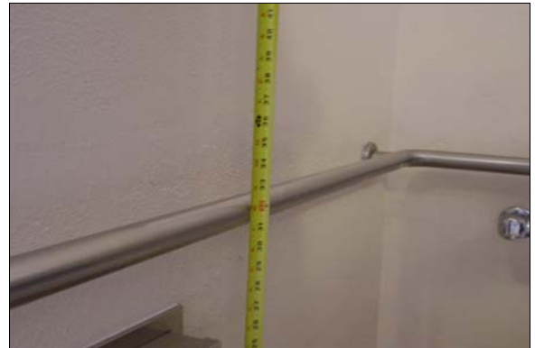
Girls Restroom next to the Cafeteria

Full Rec Remount the side and back grab bar so the height of the gripping surface is centered at 33 inches above the finished floor. The side grab bar must extend 54 inches from the back wall.