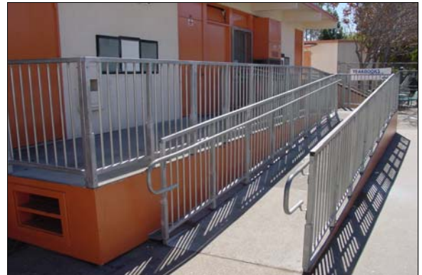
Ramp to Portables 28 & 29

Alternative Rec: * Rec: (Where Available)