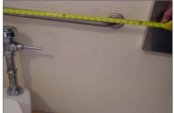
Girls Restroom next to the Cafeteria

Alternative Rec: * Rec: (Where Available)