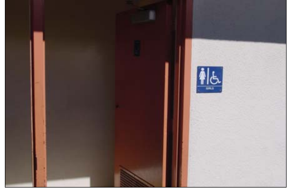
Girls Restroom next to the Cafeteria

Full Rec Adjust the closer on the interior entrance door to the restroom to a maximum door opening force of 5 pounds (see CBC 1133B.2.5.1 and ADAAG 4.13.11).