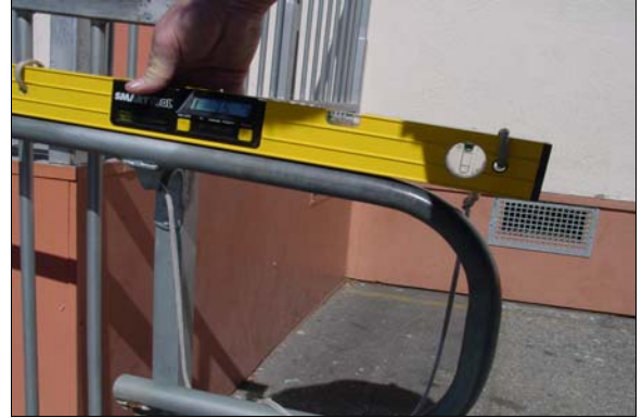
Ramp to Portables 13 &14

Alternative Rec: * Rec: (Where Available)