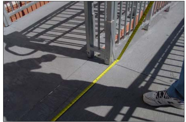
Ramp to Portables 13 &14

Alternative Rec: * Rec: (Where Available)