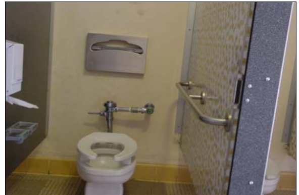
Girls Restroom next to the Cafeteria

Full Rec Install a 42/48-inch side grab bar at a height of 33 inches above the finished floor in the alternate toilet compartment.