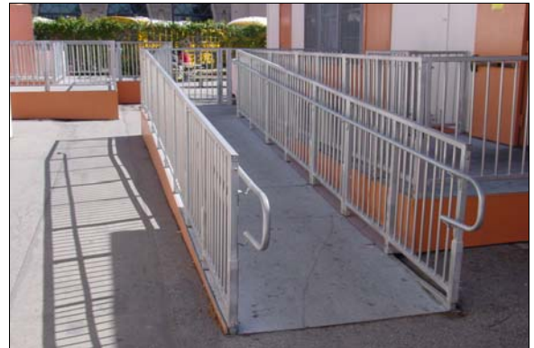
Ramp to Portable 33

Full Rec Provide compliant handrails on the ramp.