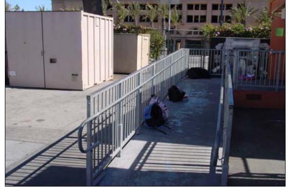
Ramp to Portables 17 &18

Alternative Rec: * Rec: (Where Available)