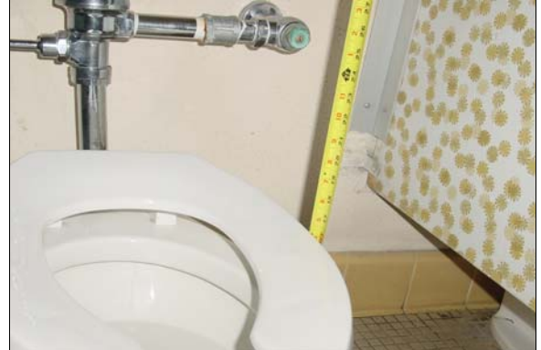
Girls Restroom next to the Cafeteria

Full Rec Remove or modify the toilet so the seat height is between 17 inches and 19 inches above the finished floor (see ADAAG 4.16.3).