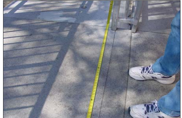
Ramp to Portables 34 & 35

Full Rec Modify or replace the intermediate switchback landing on the ramp to provide at least 72 inches in length in the direction of the run of the ramp and at least 96 inches in width to incorporate the minimum width of each run of the ramp and the distance between the parallel runs (see CBC 1133B.5.4.6 and ADAAG 4.8.4).