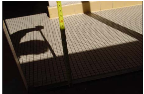
Girls Restroom next to the Cafeteria

Full Rec Modify or replace the threshold to provide a smooth transition. The threshold should not exceed a beveled 1/2 inch.