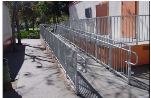
Ramp to Portables 36 & 37

Full Rec Provide compliant handrails on the ramp.