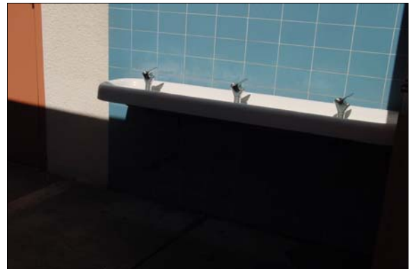
Drinking Fountain Outside the Cafeteria

Alternative Rec: * Rec: (Where Available)