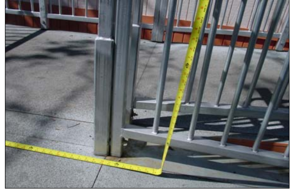
Ramp to Portables 36 & 37

Full Rec Modify or replace the intermediate switchback landing on the ramp to provide at least 72 inches in length in the direction of the run of the ramp and at least 96 inches in width to incorporate the minimum width of each run of the ramp and the distance between the parallel runs (see CBC 1133B.5.4.6 and ADAAG 4.8.4).