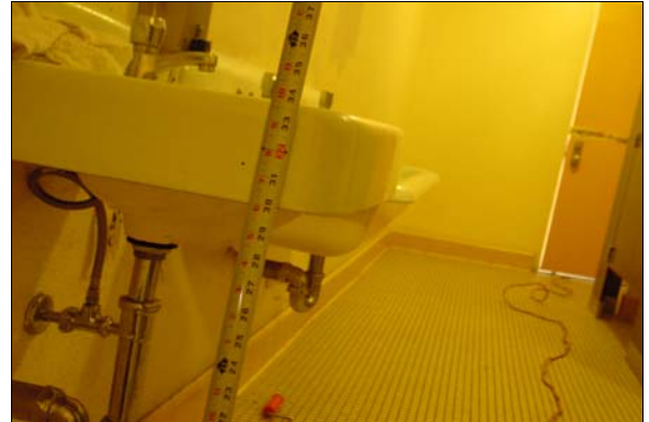
Boys Restroom next to the Cafeteria

Full Rec Insulate or otherwise configure pipes under the lavatory designated to be accessible in the restroom to protect against contact (see ADAAG 4.19.4). Make certain there are no sharp or abrasive surfaces under the lavatory.