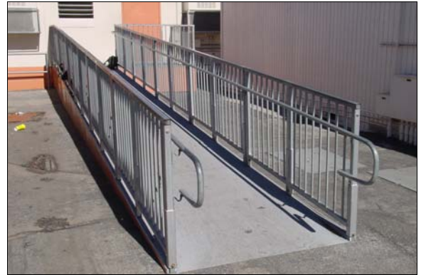
Ramp to Portable 24

Full Rec Provide compliant handrails on the ramp.