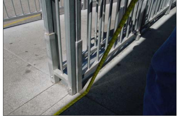
Ramp to Portables 28 & 29

Alternative Rec: * Rec: (Where Available)