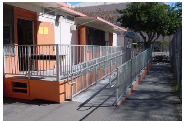
Ramp to Portables 34 & 35

Alternative Rec: * Rec: (Where Available)