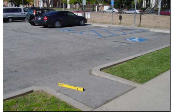
Curb Ramp next to the Accessible Parking Spaces

Full Rec Replace the concrete curb-cut ramp with a concrete curb-cut ramp at least 48 inches in width that provides a slope no greater than 8.33% and a cross slope no greater than 2%.