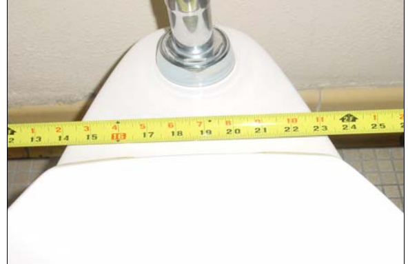
Girls Restroom next to the Cafeteria

Full Rec Relocate the toilet so that the distance from the centerline of the toilet to the nearest side wall is exactly 18 inches (see ADAAG Figure 28).