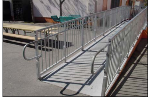
Ramp to Portable 31

Full Rec Provide compliant handrails on the ramp.