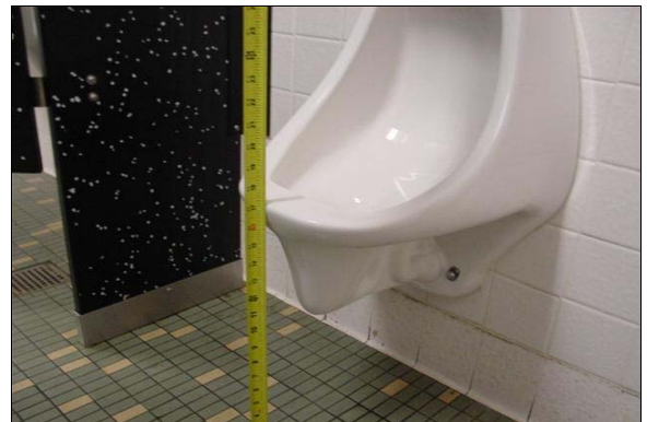
Boys Restroom Building M

Full Rec Lower the urinal designated to be accessible in the restroom so that the rim height is not more than 17 inches above the finished floor.