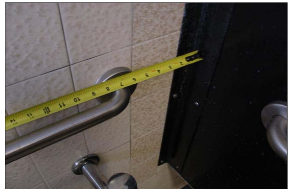
Boys Restroom Building M

Full Rec Remount the side and back grab bar in the stall designated to be accessible in the restroom so that the height of the gripping surface is centered at 33 inches above finished floor. The back grab bar shall be not more than 6 inches from the nearest side wall. Grab bars must be able to support a point load of at least 250 pounds and shall be less than the allowable shear stress of the grab bar material.