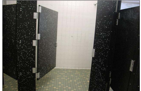
Boys Restroom Building M

Alternative Rec: * Rec: (Where Available)