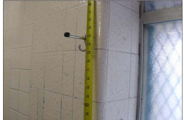
Boys Restroom Building M

Full Rec Relocate the coat hook to a height no greater than 48 inches above the finished floor.