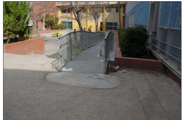
Ramp on North Side of Building D