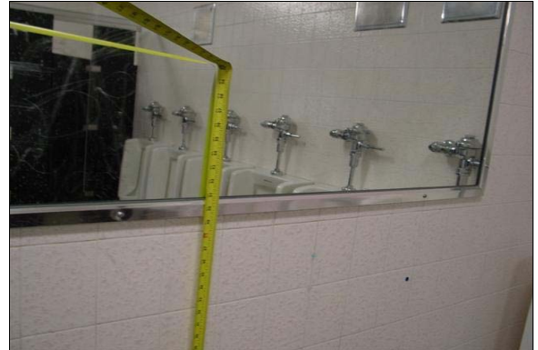
Boys Restroom Building M

Citation: ADAAG A4.19.6; CBC 1115B.9.1.2; ADAAG 4.19.6 Minimum Quantity 1 Maximum Quantity: 1 Unit: Each Minimum Estimated Cost: 291 Maximum Estimated Cost: 291 Record Number 143 Priority: