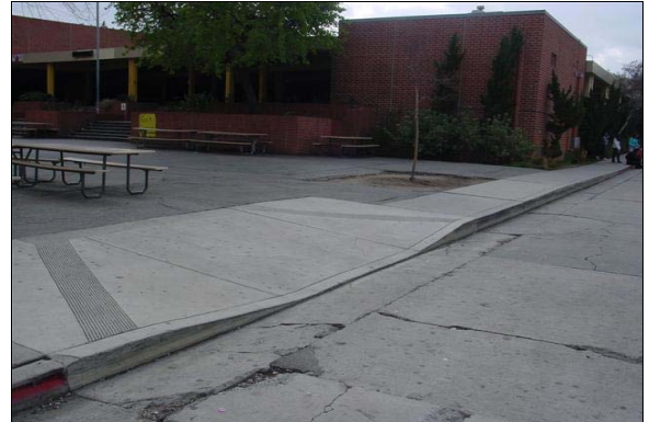
Curb Ramp Northeast of Cafeteria at Service Road