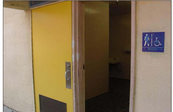
Boys Restroom Building M

Alternative Rec: * Rec: (Where Available)