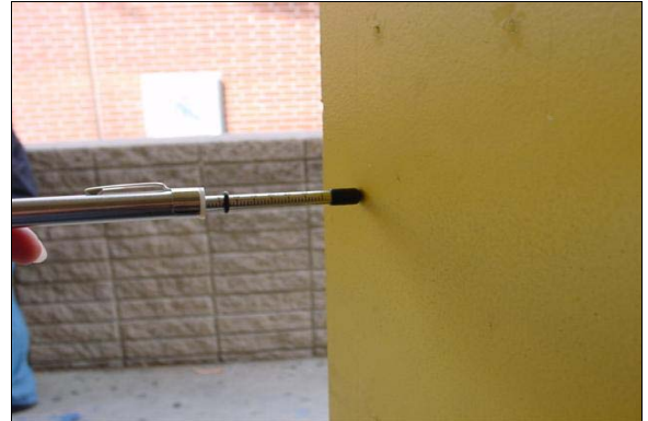
Boys Restroom Building M

Full Rec Adjust the closer on the entrance door to the restroom to a maximum door opening force of 5 pounds.