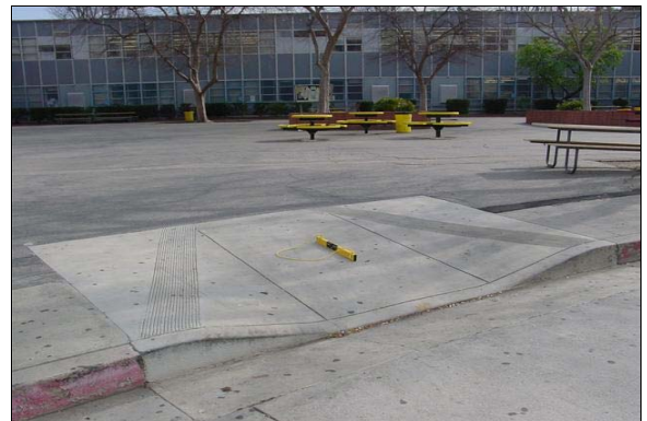
Curb Ramp at West Side of Building C at Service Road

Finding: The slope of the curb ramp is 10.3%. The slope at the top landing is 2.9%. The slope of the bottom landing is 11.7%. The slope of the side flares are greater than 10%. The transition at the bottom landing is abrupt. The curb ramp does not provide a detectable warning surface which includes truncated domes.