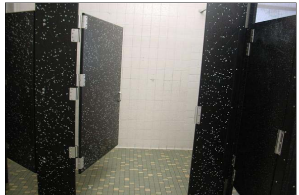
Boys Restroom Building M

Alternative Rec: * Rec: (Where Available)