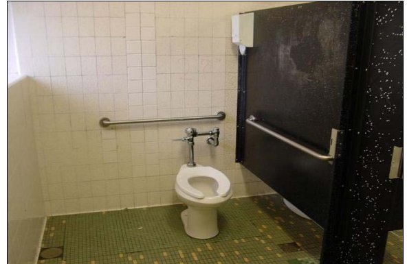
Boys Restroom Building M

Alternative Rec: * Rec: (Where Available)