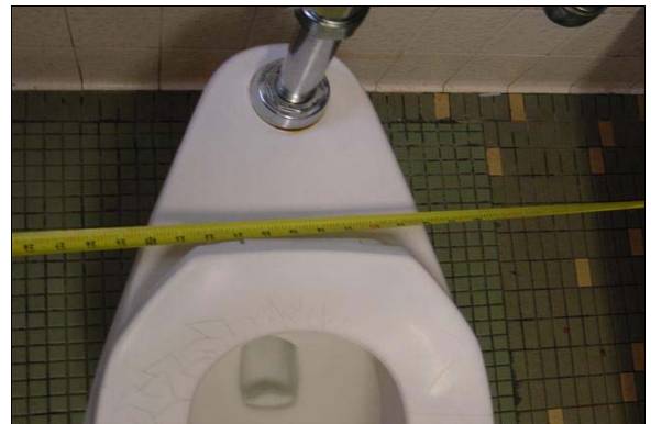
Boys Restroom Building M

Alternative Rec: * Rec: (Where Available)