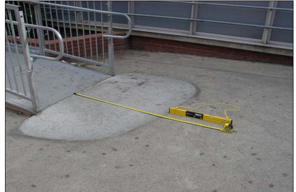
Ramp on North Side of Building D

Full Rec Modify or replace the top landing on the ramp to provide a top landing that exceeds 60 inches in length and 60 inches in width with a level surface that does not exceed a slope greater than 2%.