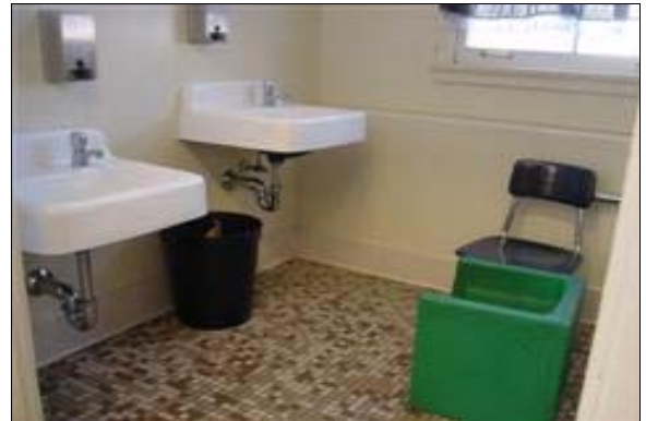
Unisex Restroom in Room 14

Full Rec Insulate or otherwise configure pipes under the lavatory designated to be accessible in the restroom to protect against contact (see ADAAG 4.19.4). Make certain there are no sharp or abrasive surfaces under the lavatory.