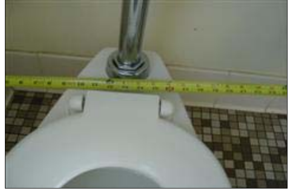
Unisex Restroom in Room 14

Full Rec Relocate the toilet to provide a distance from the centerline of the toilet to the nearest side wall at 15 inches to accommodate children ages 5 thru 12 (see ADAAG 4.16.7(1), ADAAG A4.16.7 and ADAAG Figure 28).