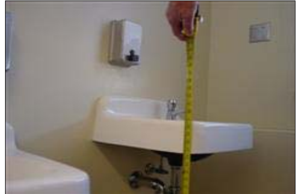
Unisex Restroom in Room 14

Full Rec Relocate the lavatory designated to be accessible in the restroom to provide a maximum rim surface height of no greater than 29 inches above the finished floor with a minimum knee clearance space of 24 inches to accommodate children ages 5 thru 12.