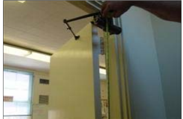
Unisex Restroom in Room 14

Full Rec Replace the door closing devices with devices that fit above the door casing and do not protrude into the primary path of travel.