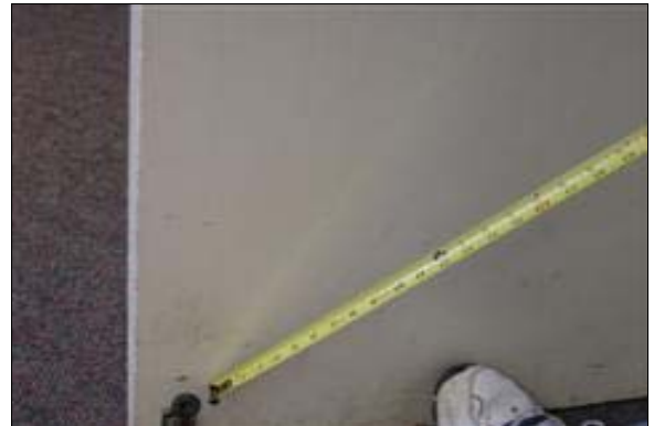
Unisex Restroom in Room 14

Full Rec Remove the doorstop from the door to provide a smooth, uninterrupted surface for the bottom 10 inches of the door.