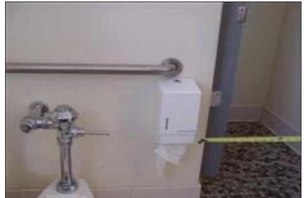
Unisex Restroom in Room 14

Full Rec Remount the toilet paper dispenser so that it is within 6 inches from the front edge of the toilet seat (see CBC 1115B.9.3, ADAAG 4.16.7(5) and ADAAG Figure 29(b)). Toilet paper dispensers must allow continuous paper flow and not interfere with the use of the side grab bar.