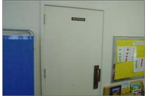
Unisex Restroom in Room 14

Full Rec Post signage centered 60 inches above the ground surface on the latch side of the entrance door identifying the restroom as accessible. Signage shall include Braille and raised lettering, the gender or unisex use symbol and the ISA symbol. Post Title 24 gender use signage on the door @ 60" o.c. a.f.f.