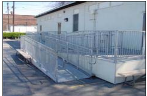
Ramp to Rooms 14 and 15

Finding: The width of the runs of the ramp are 47 1/2 inches.