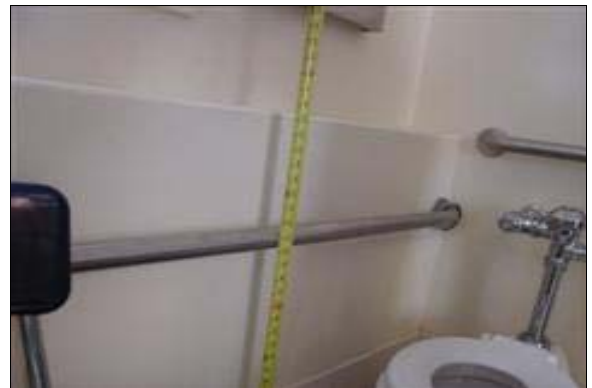
Unisex Restroom in Room 14

Full Rec Remount the side grab bars at a height 27 inches above the finished floor to accommodate children ages 5 thru 12 (see ADAAG A4.16.7). Grab bars must be able to support a point load of at least 250 pounds and shall be less than the allowable shear stress of the grab bar material.